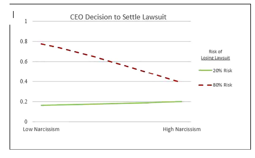
Fig. 2. (Study 3) Narcissism-risk graphed interactions.

narcissists are less likely to see expert advice as useful.